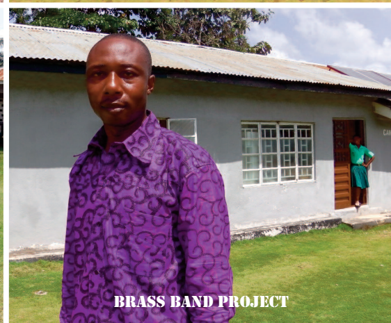
BRASS BAND PROJECT