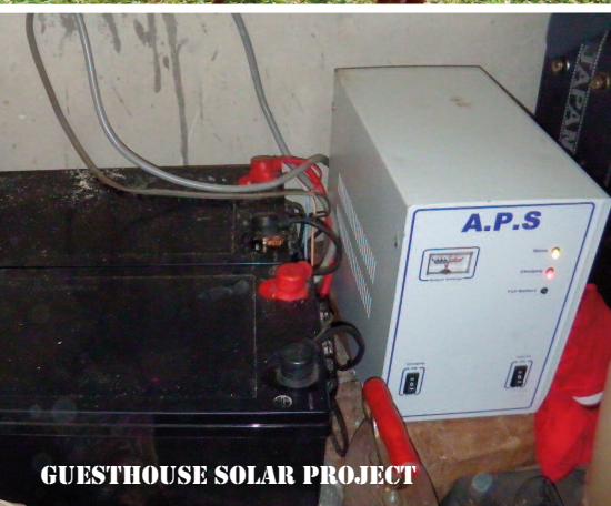
GUESTHOUSE SOLAR PROJECT