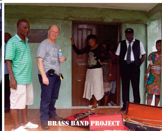
BRASS BAND PROJECT