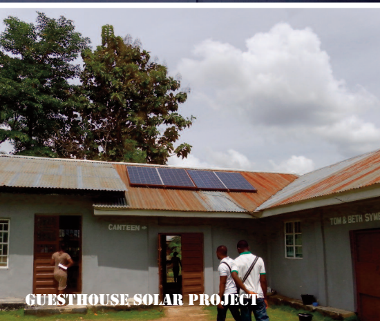
GUESTHOUSE SOLAR PROJECT