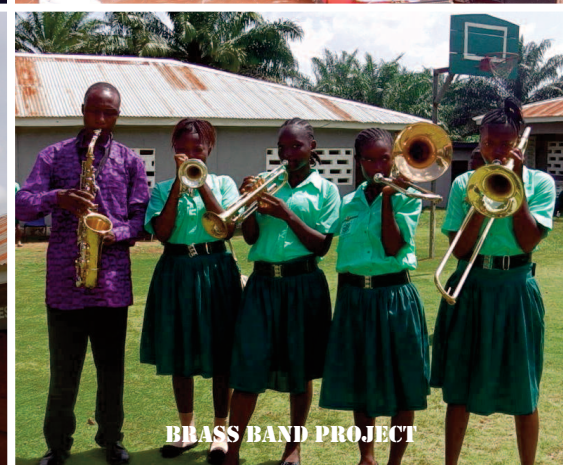
BRASS BAND PROJECT