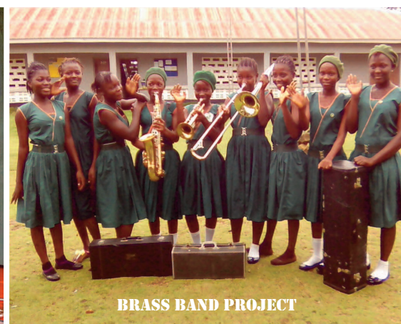
BRASS BAND PROJECT