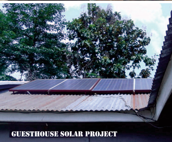
GUESTHOUSE SOLAR PROJECT